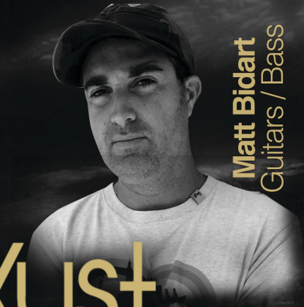
Matt Bidart Guitars / Bass